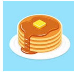
Colette getting ready to make pancakes for Shrove Tuesday.....