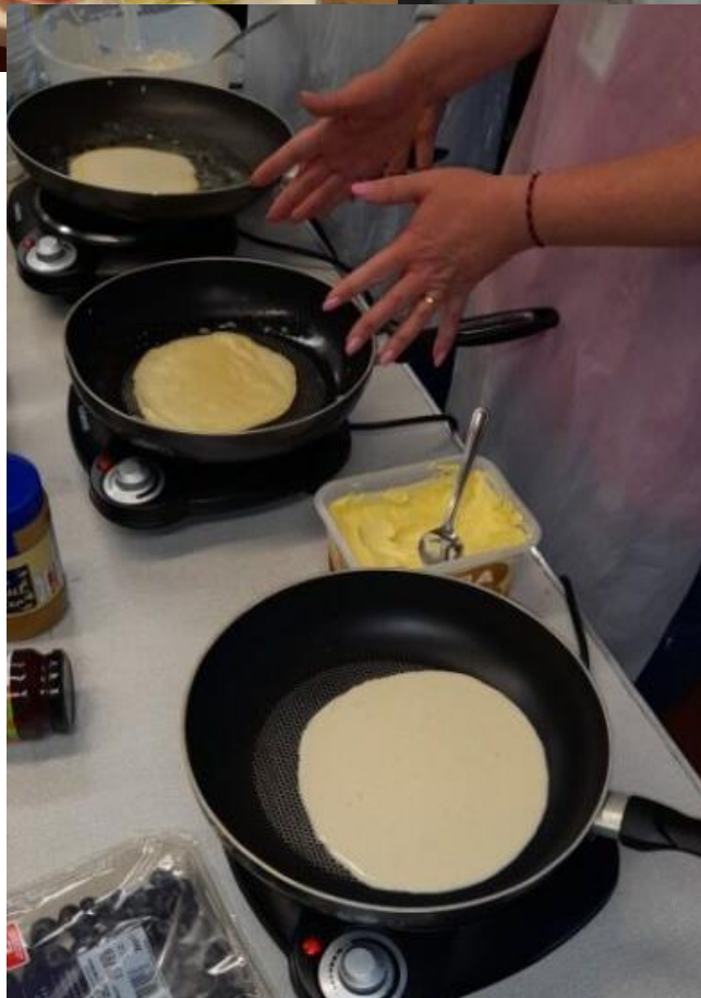
It's looking good so far....